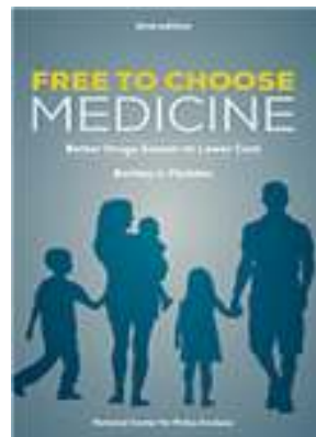
Dual tracking & TED