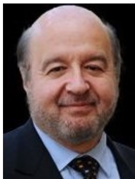
Hernando de Soto

14–16 April 2016 Maison de la Paix, Geneva